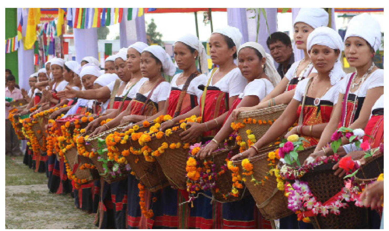
Chakma women in Arunachal Pradesh celebrating Buddha Purnima. Many indigenous peoples of Arunachal Pradesh wrongly believe that Chakmas are like the Bengali muslims because they came from East Pakistan. The Chakmas are actually of the Tibeto Mongoloid origin.

As per 2011 census (1) in Papumpare district, non Chakma/Hajong general population i.e. Adivasis, Assamese, Nepalese, Muslims, Marwaris, Muslims, Biharis etc was 57,292<sup>18</sup> against Chakma/Hajong population of 2,065 persons<sup>19</sup>; (2) in Namsai district, other non-Chakma general population was 59,937<sup>20</sup> against Chakma/Hajong population of 4,523<sup>21</sup> while (3) in Changlang district, other non-Chakma Hajong general population was 53,465<sup>22</sup> against Chakma/Hajong population of 40,883 persons.<sup>23</sup>