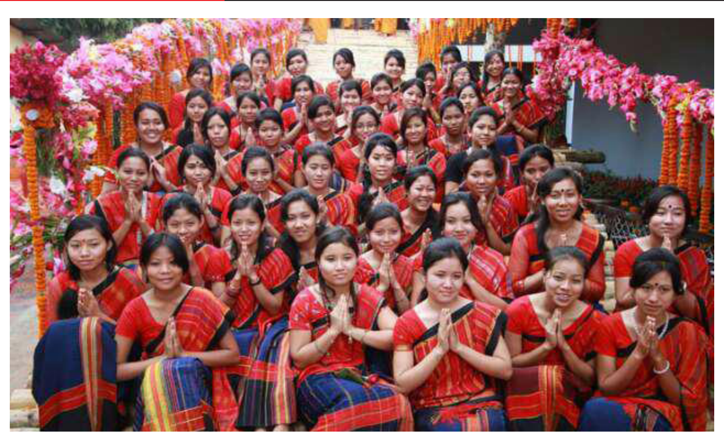
Chakma girls at a Buddhist temple in Arunachal Pradesh