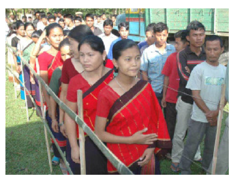
Chakma women waiting to caste their votes at Diyun, Arunachal Pradesh

It is pertinent to mention that population of the