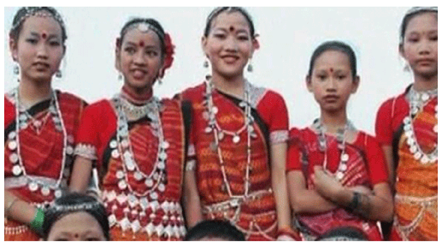
Chakma girls of Arunachal Pradesh and the Chakmas and Hajongs share are of the same Tibeto Mongoloid origin as indigenous peoples in the State

2015 Electoral Rolls, the non-tribals constitute the majority of voters with g 646 out of 857 electors in Bordumsa town.<sup>71</sup>