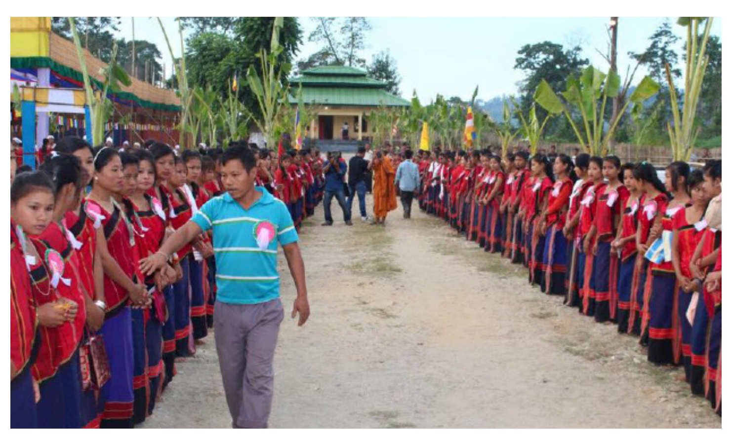
Chakma women in Arunachal Pradesh getting ready to welcome Buddhist monks during Buddha Purnima

It is also pertinent to mention that there is no likelihood of any Chakma migrating to Arunachal Pradesh. The total population of Chakmas in India as per 2011 census was 2,26,860 persons with 96,972 persons (19,554 families)<sup>31</sup> in Mizoram; 79,813 persons (18,014 families)<sup>32</sup> in Tripura; 2,032 persons (430 families)<sup>33</sup> in Assam; 466 persons (211 families)34 in West Bengal; 106 persons (44 families)<sup>35</sup> in Meghalaya (as per Census 2011) and 47,471<sup>36</sup> persons in Arunachal Pradesh. The Chakmas are recognized as Scheduled Tribe in Assam, West Bengal, Meghalaya, Tripura and Mizoram and there is no reason for the Chakmas from these States to migrate to Arunachal Pradesh where the Chakmas do not enjoy Scheduled Tribe status.