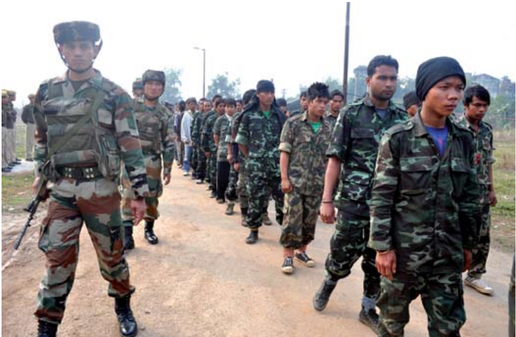
Another child soldier (right) leading the march during mass surrender before Assam Chief Minister Tarun Gogoi (l) and India's then Home Minister P Chidambaram (not seen in the picture) during mass surrender on 24 January 2012