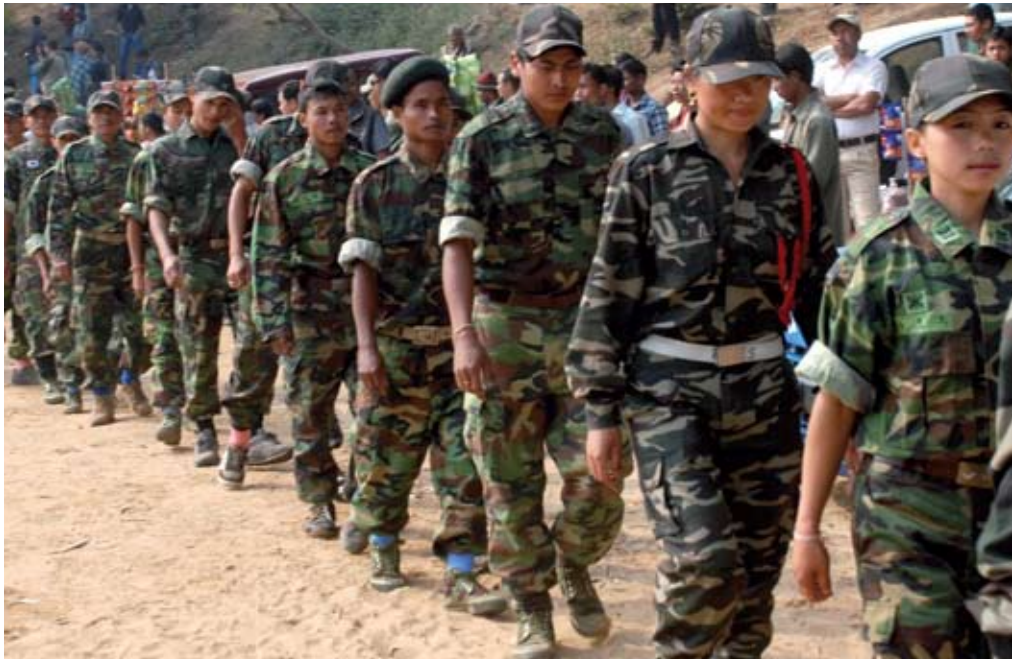
UPDS cadres surrendering at Diphu Assam on 11 December 2011