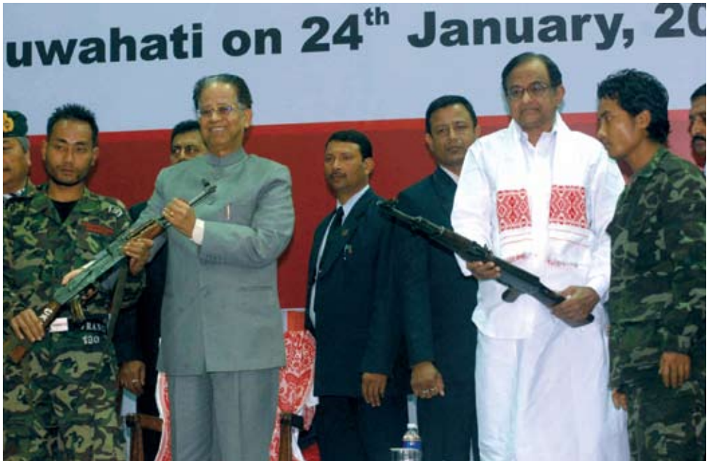
An armed cadre recruited as child soldier surrenders before Assam Chief Minister Tarun Gogoi (l) and India's then Home Minister P Chidambaram (R) during mass surrender on 24 January 2012