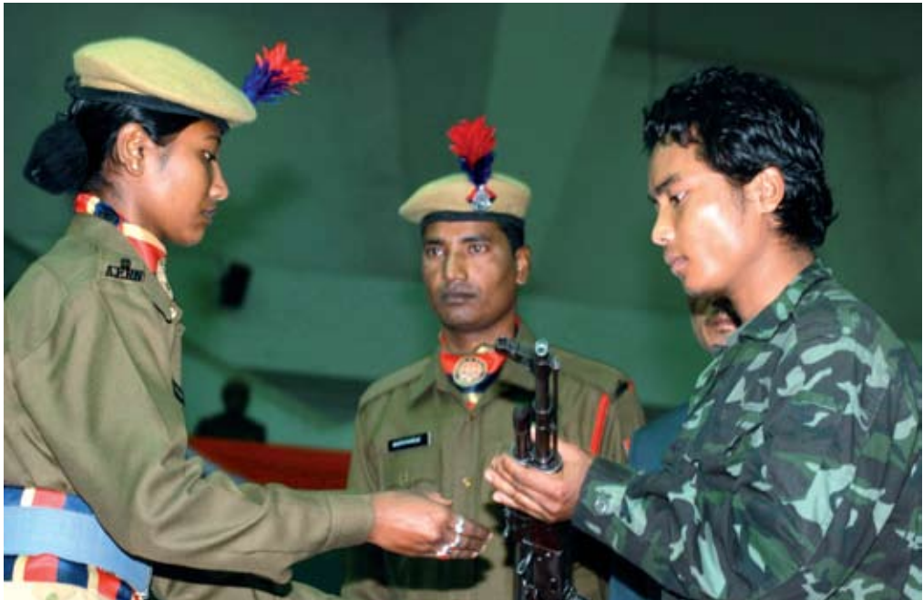
An armed cadre recruited as child soldier surrenders before Assam Chief Minister Tarun Gogoi and India's then Home Minister P Chidambaram (not seen in the picture) during mass surrender on 24 January 2012