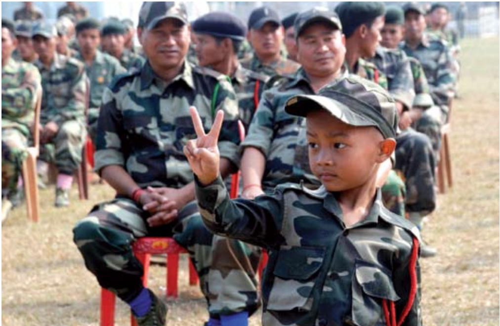
Glorified child soldier or a child dressed as a soldier at UPDS surrender at Dipu, Assam on 11 December 2001

promised the boys to get them jobs at a Singjamei Super Market shop and on January 17 th morning, he took the two boys in a van and left them with a man at Kyamgei. The same day, the two boys reached Moreh near Burma border. The police believe that the two boys might have been handed over to the Kangleipak Communist Party. 27