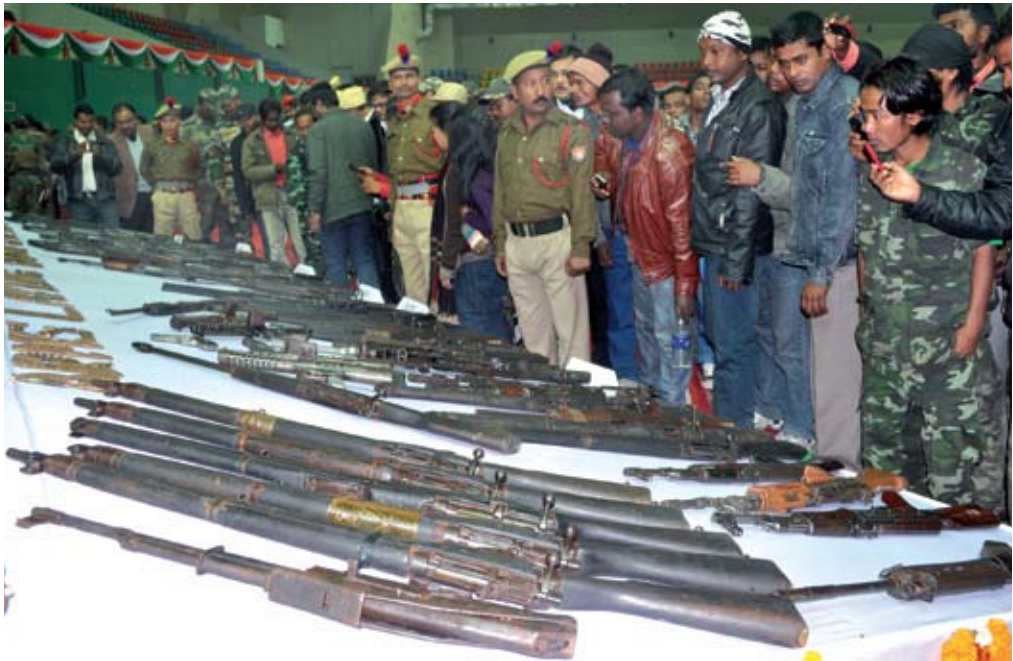
An armed cadre recruited as child soldier surrenders before Assam Chief Minister Tarun Gogoi and India's then Home Minister P Chidambaram (Not seen in the picture) during mass surrender on 24 January 2012

As the photographs show, many of those appeared to be 18 years or above but recruited when they were children.