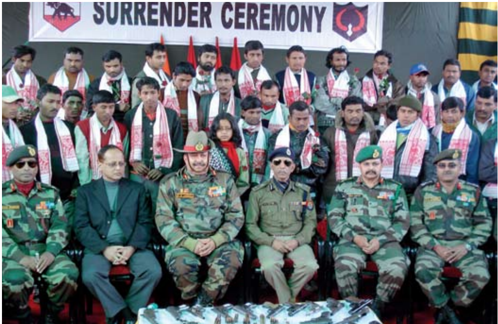
ULEA cadres including child soldiers surrender to Indian Army at Kamalpur, Assam on 24 January 2008

It has been reported that children of different age groups are trained and assigned different roles. The new entrants, aged from six to 12, are initially used as spies and couriers. They are also trained in basic drills and armed with .303 rifles. Children above 12 are used as fighters. They are trained to make and plant landmines and bombs, gather intelligence and for sentry duty. Young girls participate in the same drills as the boys. They are trained to lead operations from the front. 30