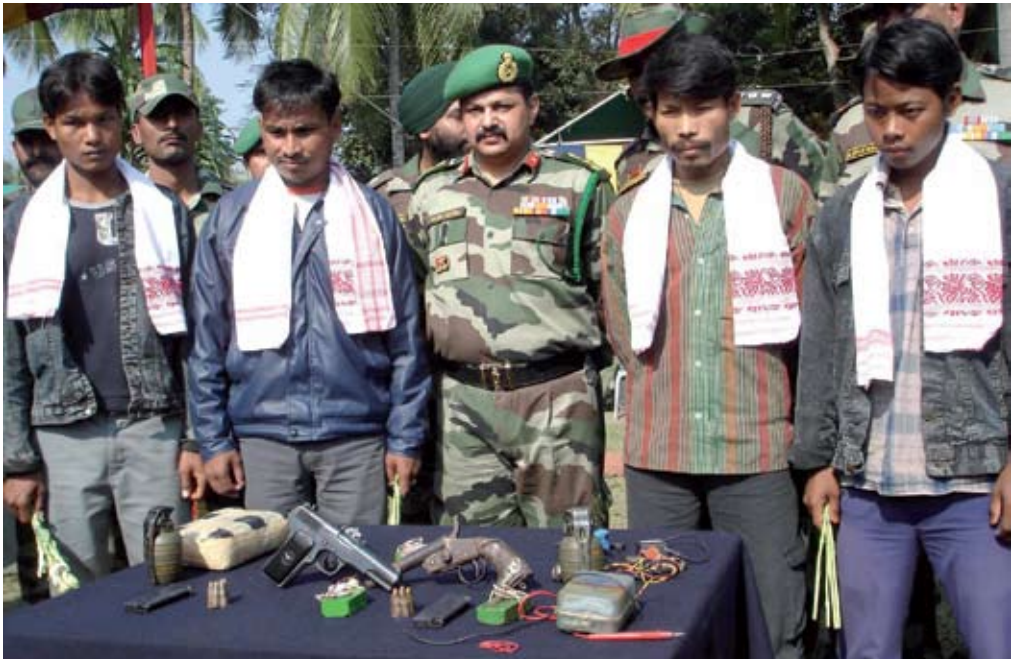
Four ULEA cadres including a 17 year old child soldier surrender to Indian Army at Kamalpur, Assam on 20 December 2007