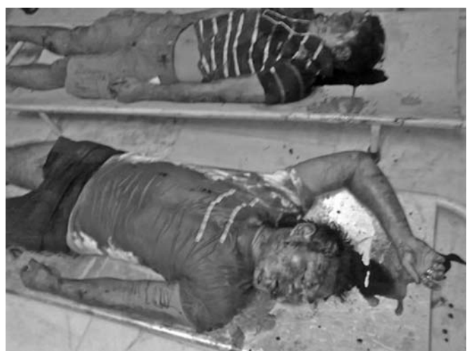
Four Bodo youths lynched on 20 July 2012 sparking the riots

For the recent riots, the National Commission for Minorities (NCM) which failed to note that the Bodos are also religious minorities sought to blame the Bodos for the current violence and stated that: