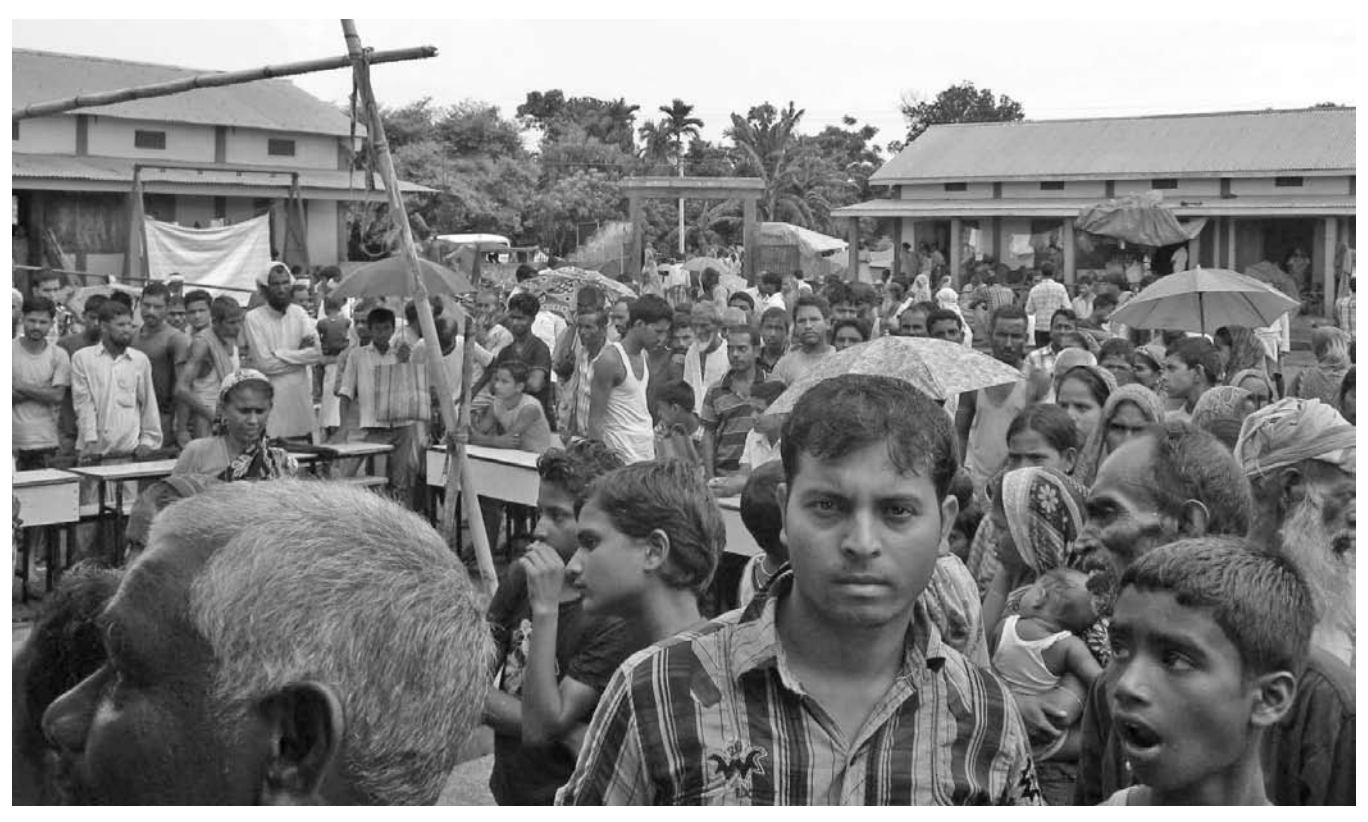
All the relief camps were overcrowded without basic amenities

The food items provided to the inmates were inadequate and the inmates were surviving on rice and dal. Except dal, no vegetable was provided to the inmates. At Bhatgaon High School Relief Camp in Kokrajhar district, food items were provided irregularly, after a gap of four-five days. Firewood was also not provided in this relief camp. <sup>109</sup> The inmates of 672 Gilaguri LP School Relief Camp in Chirang district complained that no vegetable has been given except dal. <sup>110</sup>