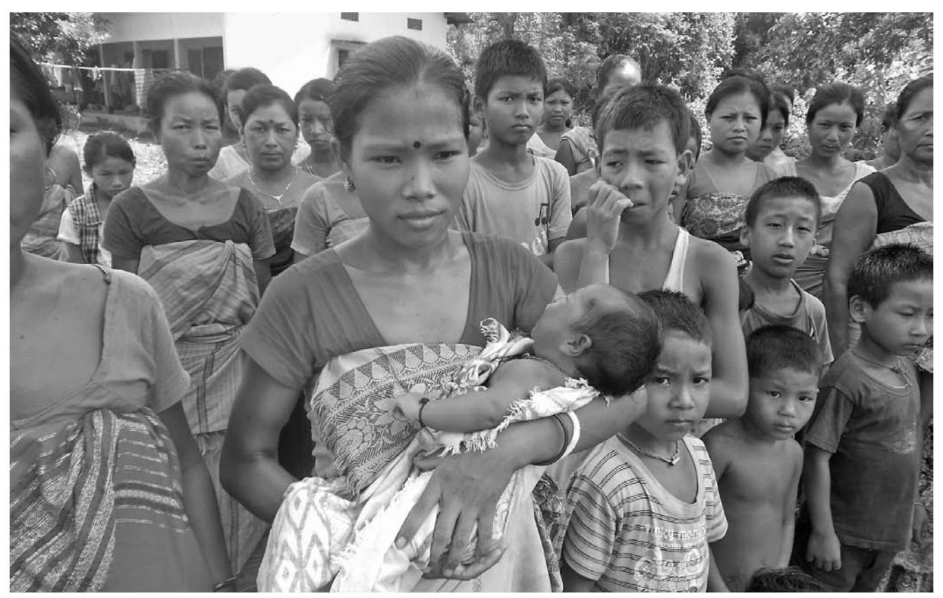
A large majority of the inmates were children and women without access to basic amenities

from 436 families, the inmates began to receive mustard oil (which is necessary to prepare dal and vegetables) only from 4 August 2012.<sup>62</sup> Shortage of dal, mustard oil, salt and vegetables was reported at Rajadabri LP School Relief Camp.<sup>63</sup> Vegetables and dal were also not being adequately supplied at Boragari ME School Relief Camp.<sup>64</sup>